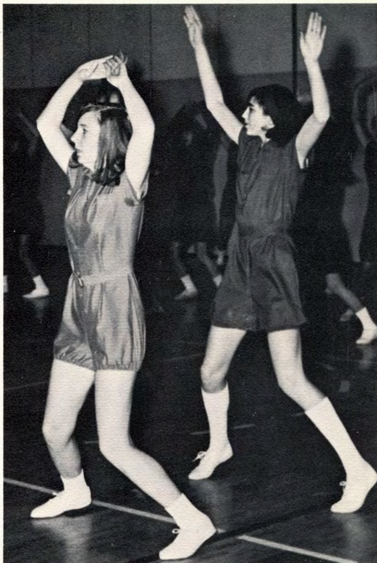
In physical education class, freshmen girls "endure" a Bonnie Pruden test.